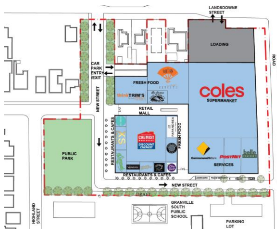
Revised Location of Park

As with the revised street layout, the relocation of the public park is also required to facilitate the proposed development's indicative single floor plate layout.