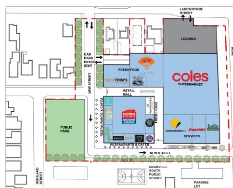
Revised New Street layout

The revised street layout seeks to facilitate the proposed single floor plate podium development and create separation to the neighbouring residential development. There is some merit to the revised street layout as it would provide greater separation between the school and the proposed neighbourhood centre development than what was previously proposed under the current DCP controls.