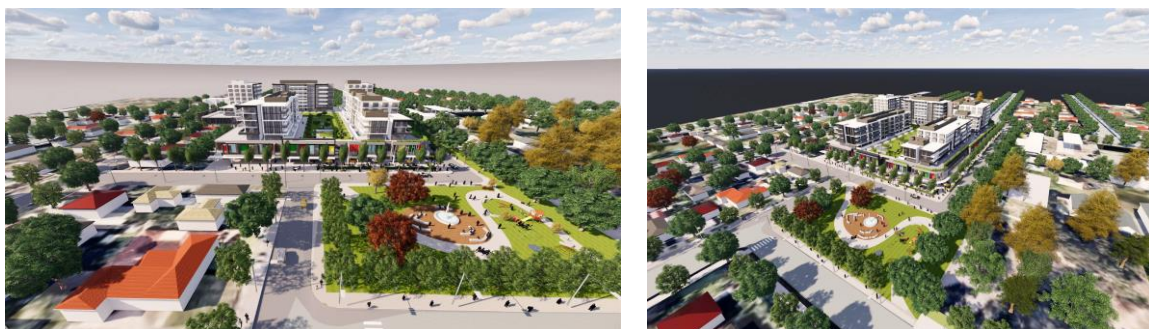
Figure 1a: New Indicative Concept Plan