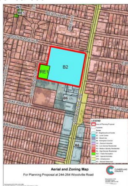
Figure 1b: Recommended zoning plan

The B2 Local Centre zone is both consistent with Council's strategic approach to the hierarchy of centres within Cumberland, as well as facilitating the proponent's expressed intention for the site, and would ensure that their vision for their new neighbourhood centre can be realised.