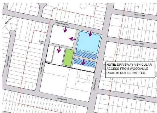
Figure 3: DCP Street Layout

The new proposal contains a revised street layout that differs to the current DCP controls. The revised street layout does not facilitate the extension of Highland Street through to Lansdowne Street. (Figure 3)