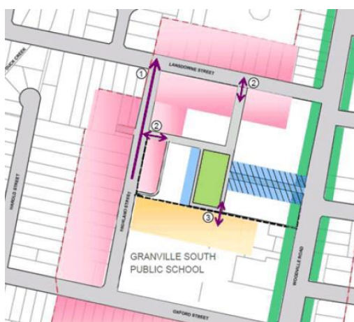
Figure 4: DCP location of Park